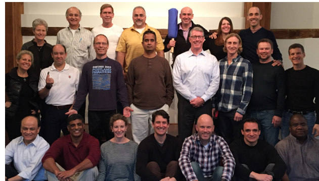
Recent graduates at Guest House

A: We do it for the chocolate-coconut haystacks! There are actually so many reasons. We love Guest House—it is starting to feel like a home away from home. It is comfortable, the food is healthy and delicious, and the space supports the development of connection and community within each group. We also love that there are no TV's! Our programs are intensive and immersive and the people and the space are incredibly supportive of us and our participants.