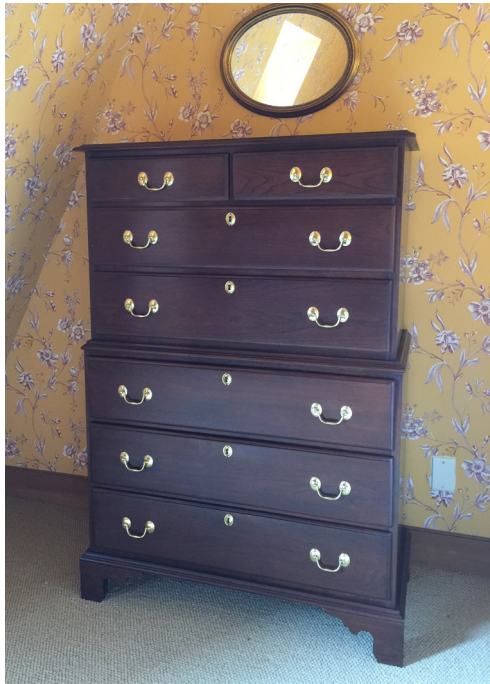
Just one part of a gorgeous Harden set