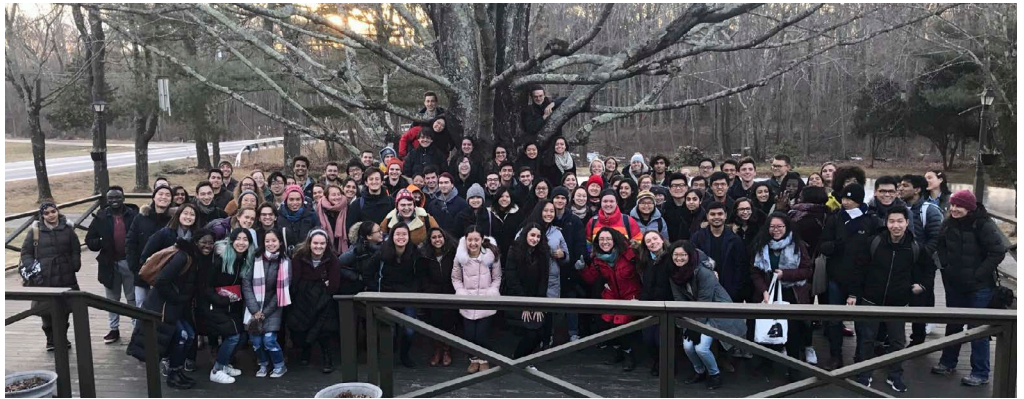
Group photo on the deck in Feb 2019.

The purpose of the retreats is for students to build a bond of affective trust early on in the semester, and to share aspects of their personal stories and future desires. By building this trust, they will use it as a foundation for deeper intellectual discovery later in the semester.