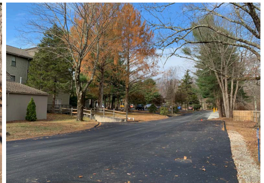
On the left, the freshly reshaped main entrance. On the right, no potholes!