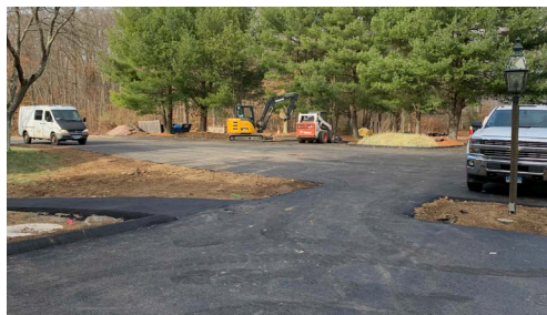
A much smoother, safer walk between lots.

What we see when we turn off West Main Street is a neatly laid layer of jet-black asphalt. And what we feel is a perfectly smooth ride. “This is going to be a game-changer for Guest House,” says Rich. “This long-needed facelift is going to benefit all of us in many ways. I am hopeful that this investment will lay the groundwork for solving a number of nagging problems that tend to go back to the basic fact that Guest House was built too low relative to the surrounding area.”