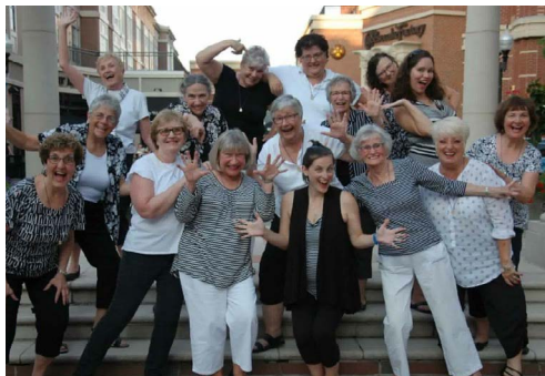
Hamming it up for the camera!

Sound of New England Chorus is the West Hartford-based chapter of Sweet Adelines International , a worldwide music education organization for women that has 21,000 singers across the globe. Under the direction of Marion Devokaitis, our 30 members sing four-part a cappella harmony in the barbershop style. We perform choreographed show tunes, big band favorites, beautiful ballads, patriotic and holiday standards—a repertoire that includes something for everyone.