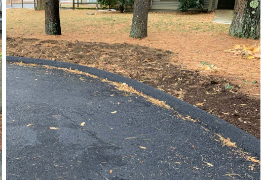
Roots during and after construction.