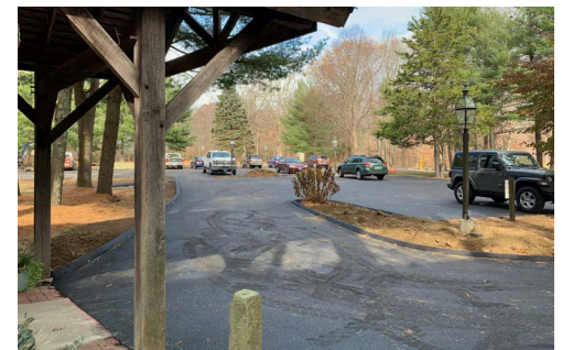
A whole new first impression.