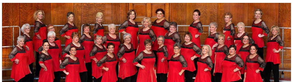
Regional competition at Symphony Hall in Springfield, MA.