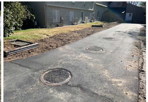
Manholes before and after construction.