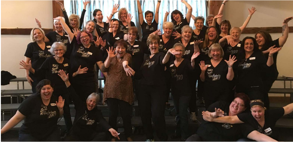
Exhausted but exhilarated at the conclusion of our annual Retreat weekend at Guest House!

not possible to mention just one favorite item from the kitchen menu. Everything was noteworthy including the homemade granola, fabulous salads, yummy roasted veggies, salmon cooked to perfection, delicious sorbets, coconut macarons and, of course, the warm gluten-free cookies at check-in.